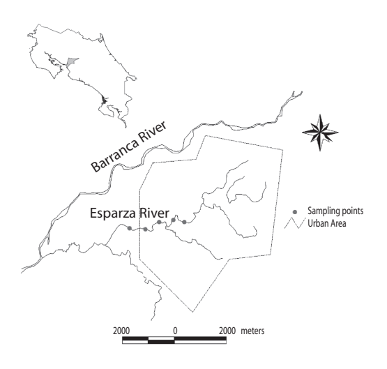
Fig. 1. Sampling points in the Barranca River Basin and study zone, Esparza River, Costa Rica. The populated area was estimated based upon topographic maps and approximate information.

The samples were obtained disturbing the substrate by hand and collecting the specimens using a strainer of 0.02 m<sup>2</sup> with a mesh of